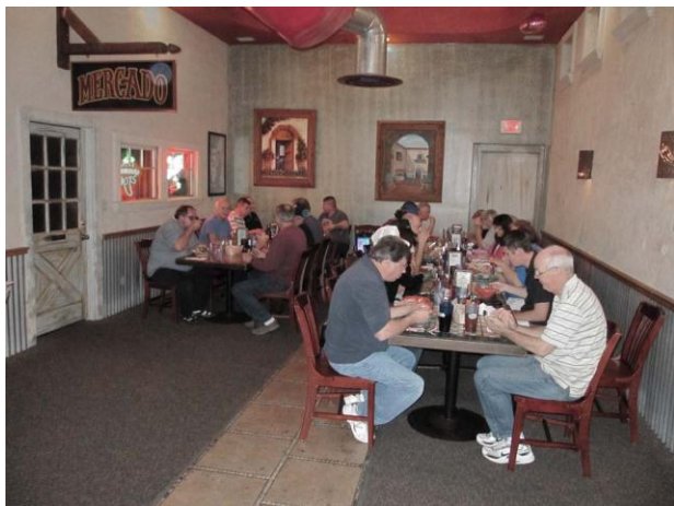
Yum! Lunch is served.