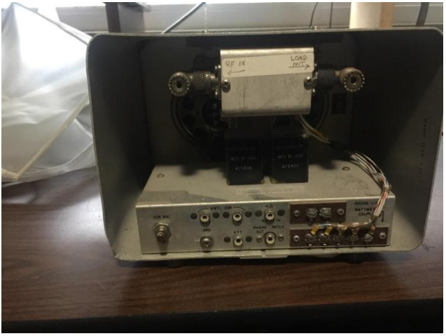
There is a antenna switch box and a phone patch box with no serial #s.