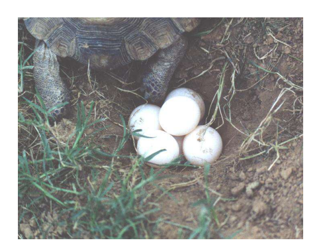
Visit the museum at <a href="http://n6jv.com">http://n6jv.com</a>.

swiped them. She wouldn't leave until she had placed the eggs. Since she never sees the eggs, I should be able to put in substitute. The only thing I could find that was the same size and shape was a handful of 12AX7s. I threw the tubes in the hole and she was happy. arranged them to satisfaction, buried them went to bed. The next day I dug up the tubes. They all survived as well as all the hatchlings in 3 months. No broken shells.