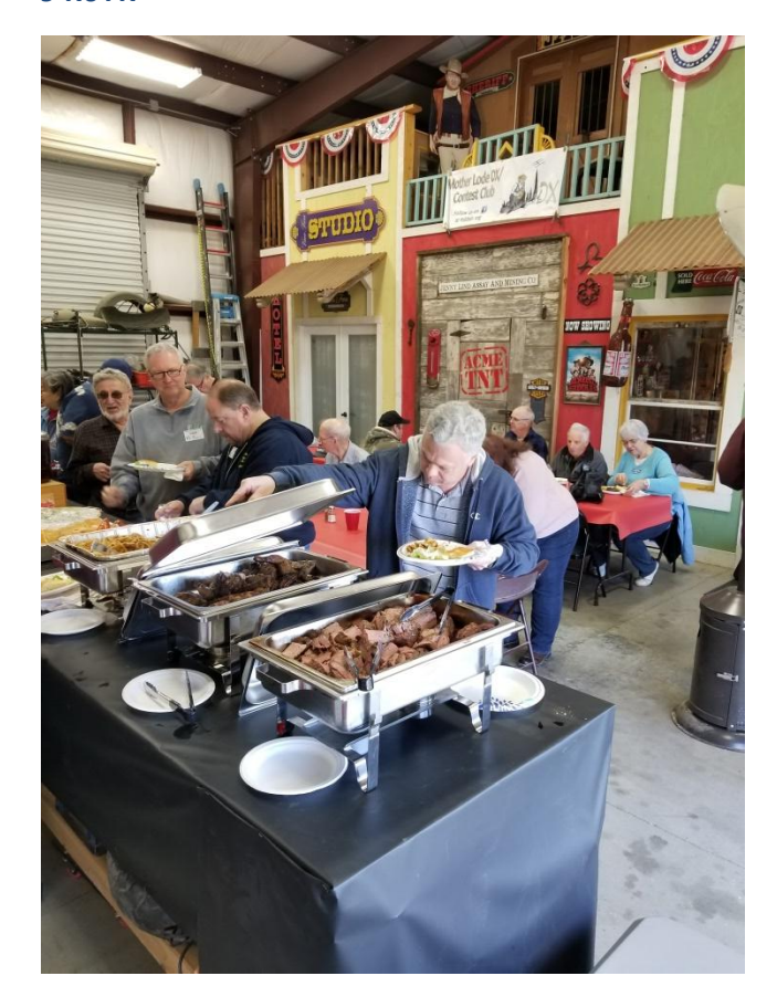
10 MMM, LOOKS GOOD!