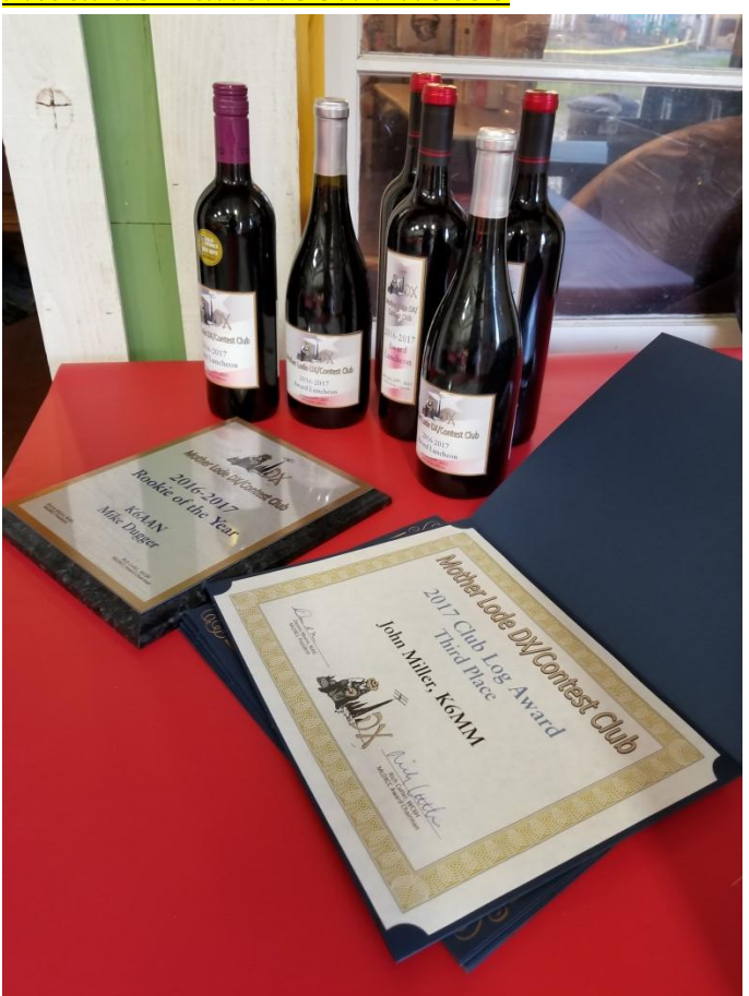
1 A FEW AWARDS TO BE PRESENTED