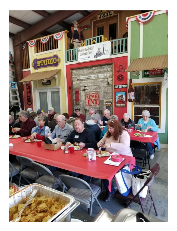
11 LUNCH IN THE OLD WEST